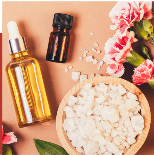
Dry, Liquid, Oil Soluble & Nutraceutical Extracts